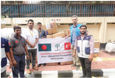
Emergency support for 2000 families who lost everything during the devastating earthquake in Turkey

OBHIZATRIK proactively offers immediate aid to communities affected by natural and man-made disasters. Swift distribution of essential supplies, provision of medical assistance, and facilitation of shelter are key priorities. Rapid response teams carefully assess needs and coordinate relief efforts to ensure timely support for the most vulnerable. In times of calamity, OBHIZATRIK stands at the forefront, committed to prevailing and protecting those in need. Through prioritizing prompt action and collaboration, OBHIZATRIK endeavors to alleviate suffering and nurture resilience in crisis-affected areas.