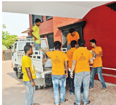
5 tons of emergency aid has been given to the Nepal Embassy of Bangladesh during the earthquake in Nepal 2015