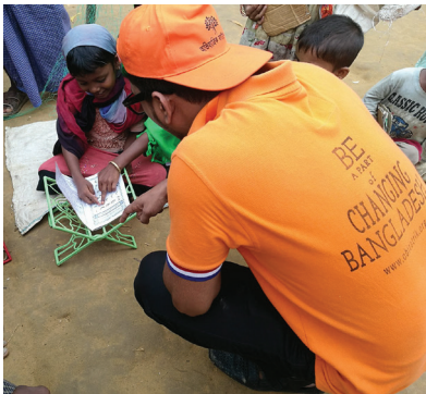
Nutrition and health support for the 1000 Rohingya women and children