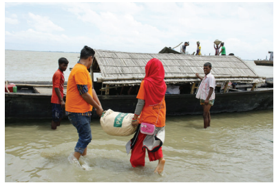
Supported more than 1 million families after natural disasters hit the coastal areas of Bangladesh.